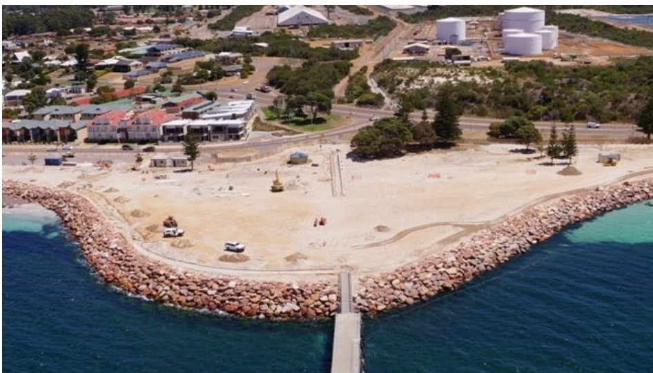
Esperance Waterfront Landscape Development project progress

The 150 mm irrigation line has been extended the length of the construction site in preparation for the establishment of 60,000 plants and turf.